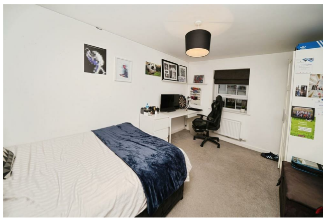
Bedroom 3 13'3" x 10'3" (4.05m x 3.12m)

Upvc double glazed window to the front aspect and a gas central heating radiator.