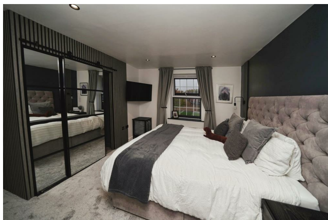
Bedroom 1 12'7" x 10'4" (3.83m x 3.14m)

Upvc double glazed window and a gas central heating radiator, sliding door leading to the dressing area.