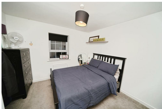
Bedroom 2 13'7" x 8'10" (4.15m x 2.70m)

Upvc double glazed window to the rear aspect and a gas central heating radiator.