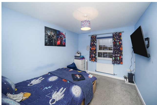
Bedroom 4 11'9" x 10'3" (3.58m x 3.12m)

Upvc double glazed window to the front aspect and a gas central heating radiator.